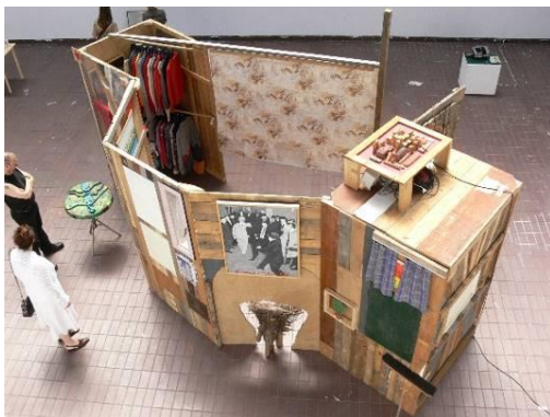
Wooden house 10 panels