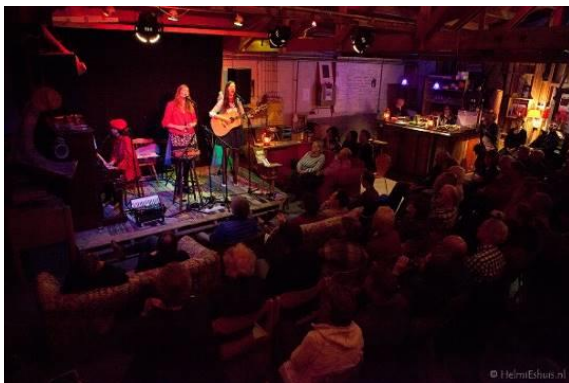
Podium Paco Plumtrek, de Achtzaligheden