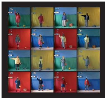
16 x 16