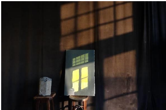
There where the light comes in