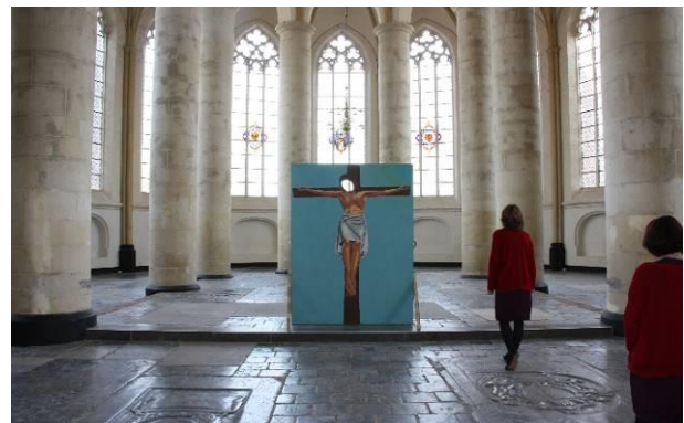
Procession Bergkerk Deventer