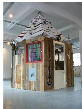
Wooden house 5 panels