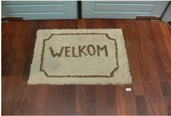
WELKOM Cityhall Almelo